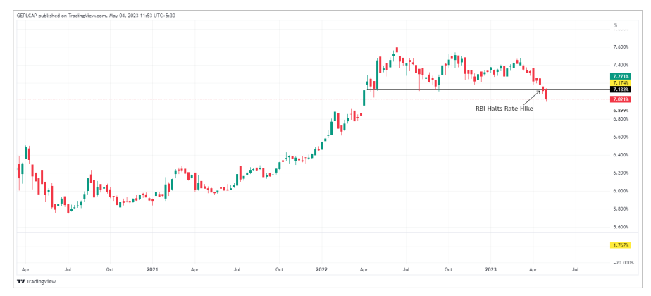
Exhibit 04: India 10 Year G-Sec Yield

.........Weakness at 10YR Yield augurs positive for Indian equities.