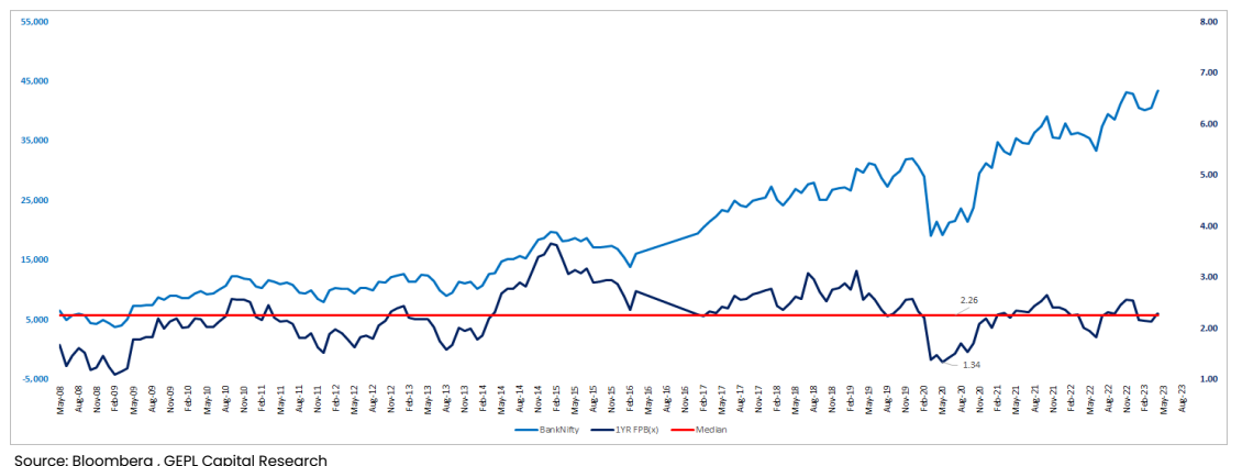
Exhibit 06: Bank Nifty and 1 YR Forward PB(x)

......Bank Nifty trades at par with 1 yr Forward PB.